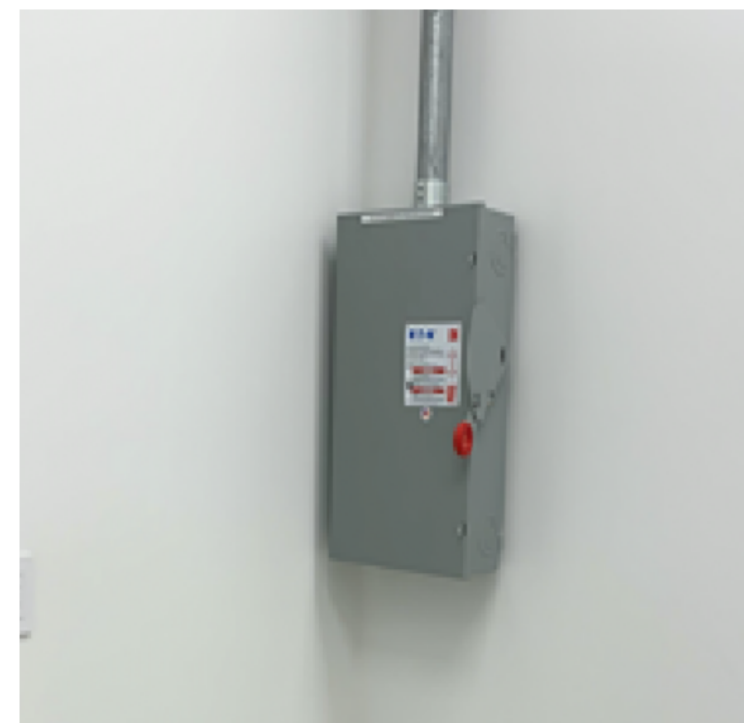
240 Vac (100 A-125A)